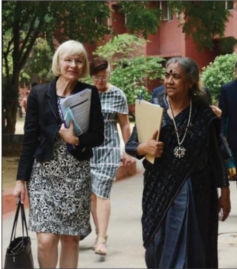
Delegation from University of Queensland, Australia on 4th August 2022- Talk on “Women in Leadership in Contemporary Times”