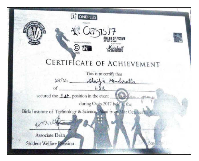
First Position in Tandav at BITS, Pilani

First position in Nazakat at Manav Rachna