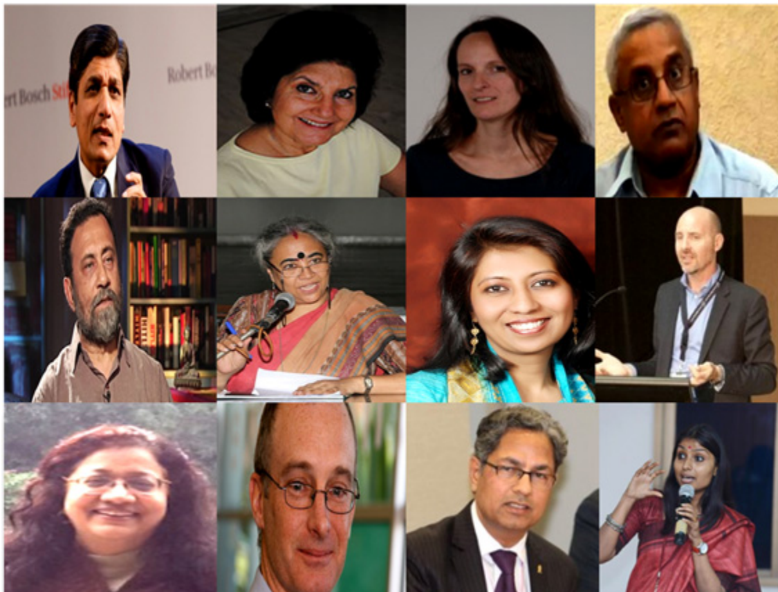
Speakers who visited the ASSK Centre for Peace in 2015-16